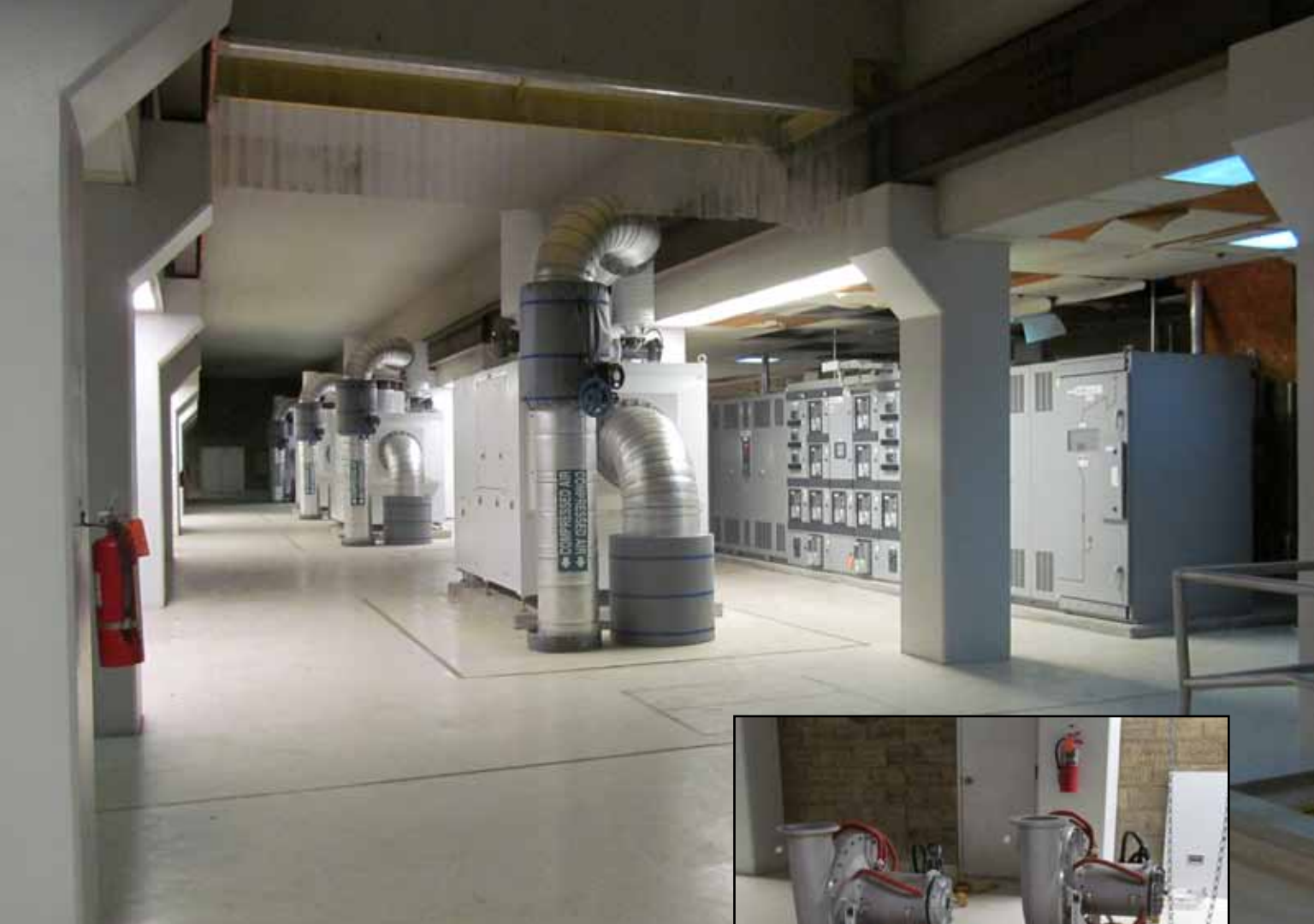
The upgrades to the Little Miami facility installed four blower enclosures. Each enclosure contains two blower cores, which are shown removed from the enclosure.