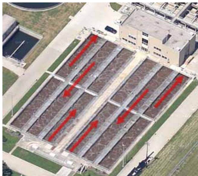
The Muddy Creek facility's secondary aeration tanks operate in a plug-flow configuration. Flow makes three passes through the system. The arrows above show the direction of the flow through the tanks.

Four new single-stage, direct-drive centrifugal blowers were installed at Muddy Creek. New butterfly air control valves, dissolved oxygen meters, and air flowmeters also were installed. The blower control system installed is similar to Little Miami's; however the header pressure setpoint is adjusted automatically to control dissolved oxygen by a most-open-valve (MOV) algorithm.